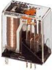
KAMMRELAIS ®, contact F 104, size 2, heavy-duty contact, 2 PDTs, input voltage 24 V AC

Please be informed that the data shown in this PDF Document is generated from our Online Catalog. Please find the complete data in the user's documentation. Our General Terms of Use for Downloads are valid ( http://phoenixcontact.com/download )