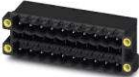
The figure shows a 10-pos. version with 20 contacts

Header, Nominal current: 12 A, Rated voltage (III/2): 400 V, Number of positions: 9, Pitch: 5 mm, Color: black, Contact surface: Tin, Assembly: Taped SMD/THT/THR components