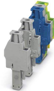
Illustration shows various versions of the product (left, center and right element) in different color combinations

http://eshop.phoenixcontact.de/phoenix/treeViewClick.do?UID=3045745