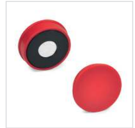
View of magnetic surface