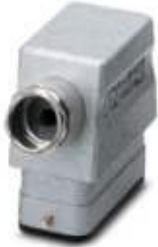
The illustration shows version HC-D 15-TFL-66/M1 PG 16 S

Sleeve housing, for single locking latch, height 66 mm, without screw connection, 1x Pg16, lateral cable entry