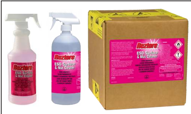
Figure 1. Reztore® Surface & Mat Cleaner: 16 Ounces (500 mL) Spray Bottle 1 Quart (1 liter) Spray Bottle 2.5 Gallons (10 liters) Bag-in-Box