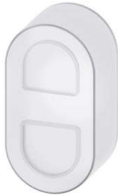
Silicone-free protective cover for Twin pushbutton, raised clear