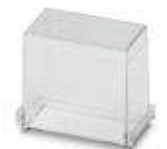
Covering hood, for the contact and dust-protected encapsulation of the components, in transparent design. Height: 35 mm, width: 22.5 mm

Electronic housing - EMG 22-H 52MM GN - 2946175