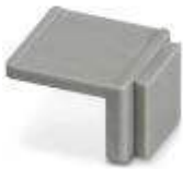
Equipment marker, narrow

Marking material - EMG-SGKS 10 - 2947585