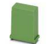
Covering hood, for the contact and dust-protected encapsulation of the components, in green design. Height: 52 mm, width: 22.5 mm

Electronic housing - EMG 22-H 52MM GN - 2946175