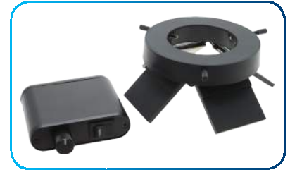
OLED Ring Light reduces glare and provides a natural light tone