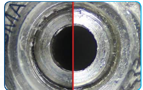
OLED Ring Light