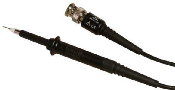
Model 6497 Modular Passive Oscilloscope Probe with Readout Actuator