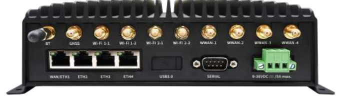
DIGI TX54 DUAL WI-FI — BACK