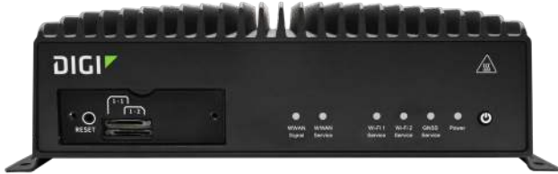
DIGI TX54 DUAL WI-FI — FRONT