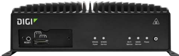
DIGI TX54 — FRONT