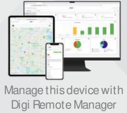
Manage this device with Digi Remote Manager