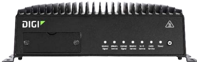
DIGI TX54 DUAL CELLULAR — FRONT