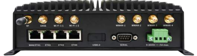
DIGI TX54 — BACK