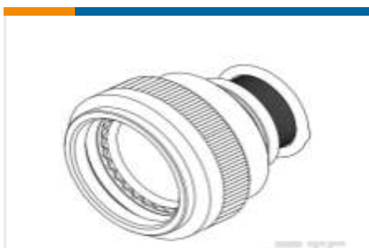
TE Part #CW0597-000 TX40AZ00-1814