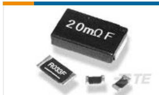
TE Part #2-1879378-3 TLR 2512 3.0W R0015 1% 50PPM 2K RL