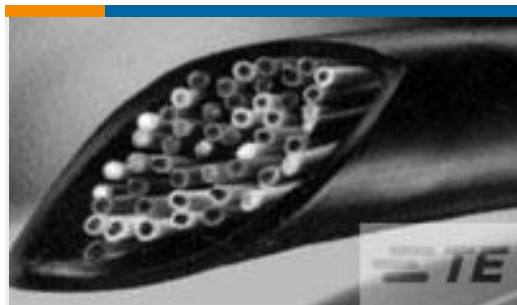
TE Part #1208484001 NTRF-3/16-0-SP