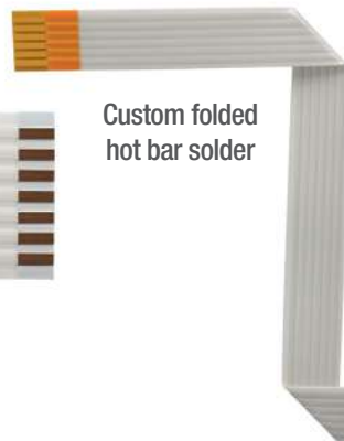
Custom folded hot bar solder