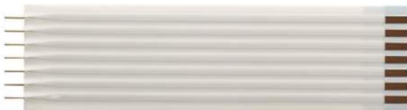
2.54mm RFC Polyester insulation - Hybrid - Type B