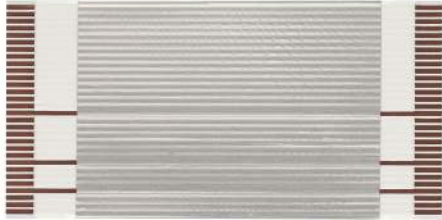
1mm tin plated, foil shielded FFC with conductors grounded to shield