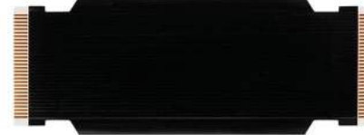
.5mm gold plated, notched FFC with black PET jacket