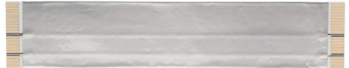
0.5mm gold plated, foil shielded FFC with conductors grounded to shield