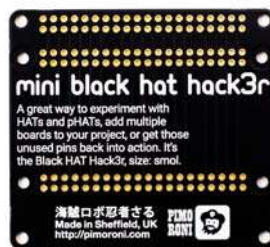
PCB only PIM171