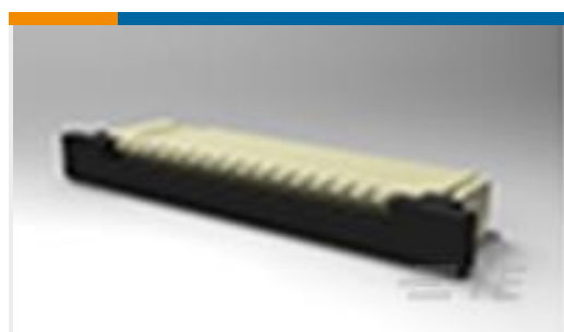
TE Part # 2-84953-6 1MM FPC HORZ.TOP CONT.ASSY 26P