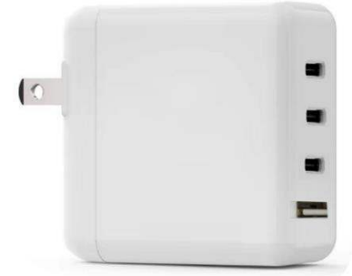
*Product images are for illustrative purposes only and may vary from actual design.