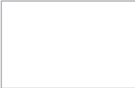
Separating a strip from the WMB or WMB marker card.