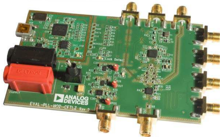
Figure 1. EVAL-CN0285-EB1Z