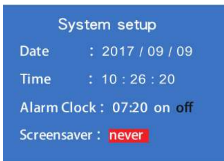
Figure 4 Setup menu

Note: The unit can also be operated permanently with a mains adaptor.