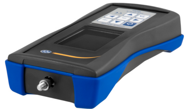
PCE-DFG N 200 Digital force gauge

For tensile force measurement and pressure force measurement up to 200 N / Very high accuracy / Sampling rate 1600 Hz / 6 different measuring tips / USB interface / Software / Calibration certificate