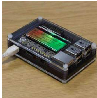
Display-O-Tron 3000 top PIM093