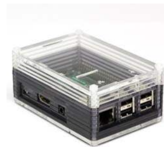
Height extension PIM060