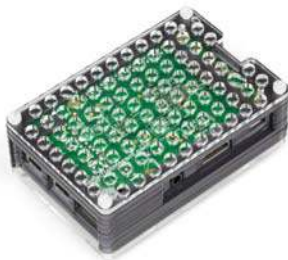
LEGO® compatible base PIM065