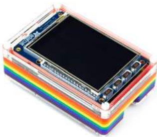
PiTFT Plus layers PIM092