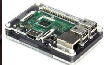
Coupé Heatsink top PIM167

Need to adapt your Pibow to fit your project? These handy extension layers will sort you out!