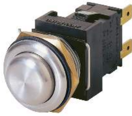
H8300RP - - -