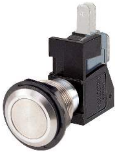
C0911VA - - -