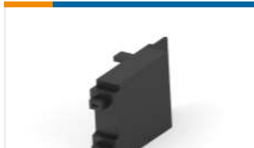
TE Part #3-1437603-8 DPS9131AK=1-2-4-8 BCD CODE