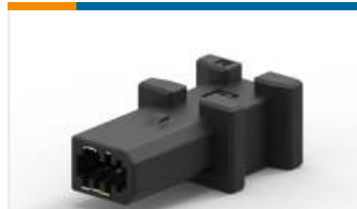
TE Part #1971153-1 CONN ASSY INDUSTRIAL MINI I/O