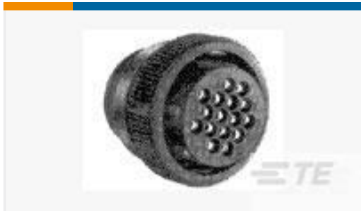
TE Part #206060-1 CPC PLUG ASSEMBLY SIZE 11-4