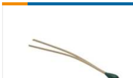
TE Part #GA30K6A11A DISCRETE 30K OHMS,+/-0.1C FROM 0C TO 70C