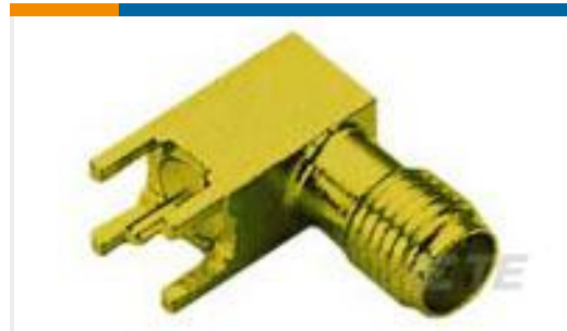
TE Part #3-1478978-1 SMA R/A PCB SKT GB