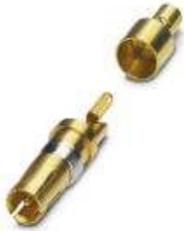
Coaxial contact, for D-SUB combination inserts, solder cup, socket, straight, for cable RG -178, gold-plated

Please be informed that the data shown in this PDF Document is generated from our Online Catalog. Please find the complete data in the user's documentation. Our General Terms of Use for Downloads are valid ( http://phoenixcontact.com/download )