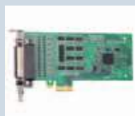
PX-335: LP PCIe 4xRS422/485 1MBaud