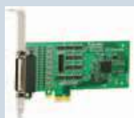
PX-346: PCIe 4xRS422/485 1MBaud