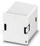
Replacement cover for slot 1 in base unit.