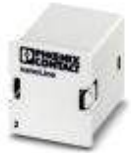
Replacement cover for slot 2 in base unit.

Covering hood - NLC-MOD-CAP-PXC - 2701292