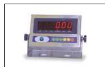
RD-1000 Resistive Load Cell Display