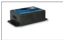
DI-100/DI-1000U Digital Load Cell Interface