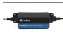
AI-1000 Signal Conditioner