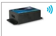
DI-1000ZP Wireless Load Cell Interface