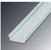
DIN rail, material: Galvanized, unperforated, height 7.5 mm, width 35 mm, length: 2 m

DIN rail - NS 35/ 7,5 ZN UNPERF 2000MM - 1206434