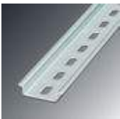
DIN rail, material: Galvanized, perforated, height 7.5 mm, width 35 mm, length: 2 m

DIN rail - NS 35/ 7,5 ZN PERF 2000MM - 1206421