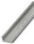
DIN rail, material: Aluminum, unperforated, height 7.5 mm, width 35 mm, length: 2 m

DIN rail - NS 35/ 7,5 AL UNPERF 2000MM - 0801704