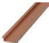
DIN rail, material: Copper, unperforated, height 7.5 mm, width 35 mm, length: 2 m

DIN rail - NS 35/ 7,5 CU UNPERF 2000MM - 0801762