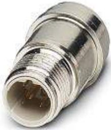
Sensor/actuator flush-type plug, 5-pos., M12, B-coded, front/press-in mounting, with straight solder connection

Please be informed that the data shown in this PDF Document is generated from our Online Catalog. Please find the complete data in the user's documentation. Our General Terms of Use for Downloads are valid ( http://download.phoenixcontact.com )