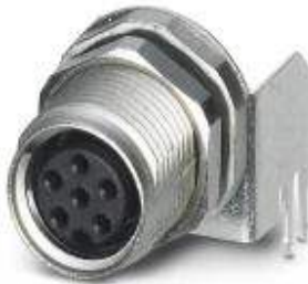
Sensor/actuator flush-type plug-in connector, socket, 6-pos., M8, rear/screw mounting with M10 fastening thread, with angled solder connection

Please be informed that the data shown in this PDF Document is generated from our Online Catalog. Please find the complete data in the user's documentation. Our General Terms of Use for Downloads are valid ( http://download.phoenixcontact.com )