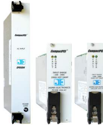
COMPACTPCI® SERIES FRONT VIEW