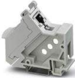
Patch panel, RJ45, DIN rail mounting, IP20, 1 slot, IDC connection, CAT6

Please be informed that the data shown in this PDF Document is generated from our Online Catalog. Please find the complete data in the user's documentation. Our General Terms of Use for Downloads are valid ( http://download.phoenixcontact.com )