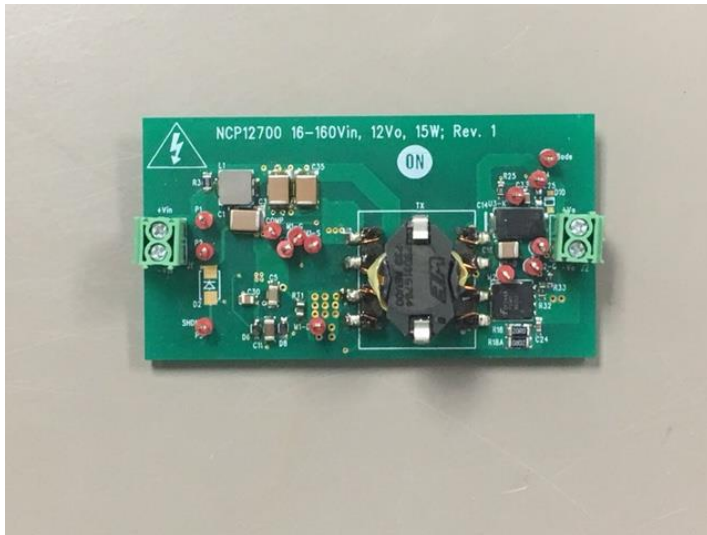
Figure 2: EVB # 2