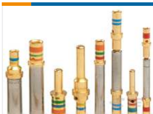
TE Part #2562-201-2031L CONT SOC ASSY