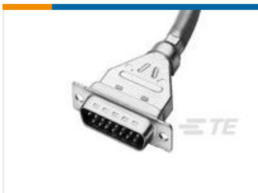
TE Part #5747958-1 KIT,PLUG,37P,HDP-20,SHLD ENCLS