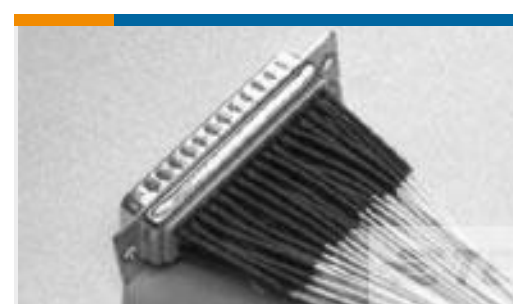
TE Part #CB4324-000 V4-0.4-0-SP