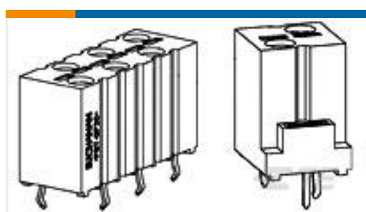
TE Part #1811398-1 ASY,SCRLESS WIRE CONN,VERT,6P