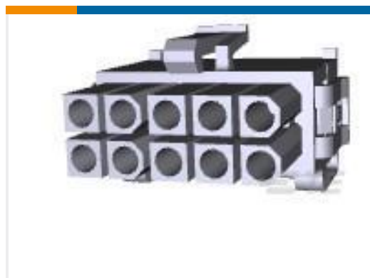
TE Part #794196-1 10P MINI UMNL2 PLUG HSG UL94V0