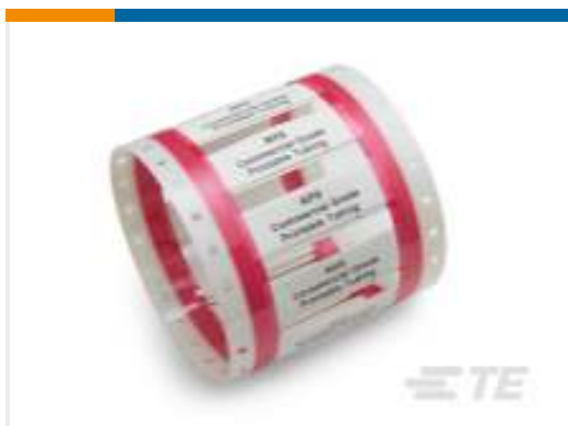
TE Part #8296870003 RPS Commercial Grade Sleeves