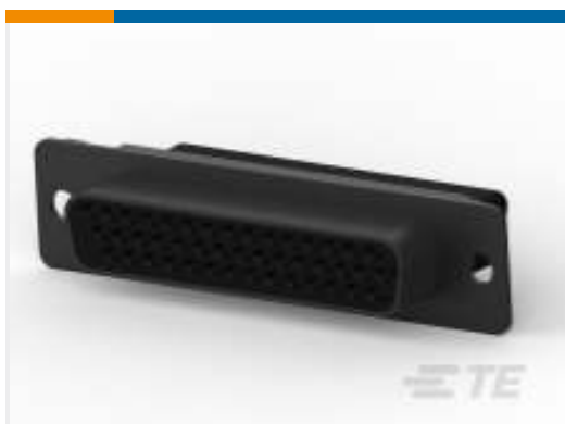
TE Part # CAT-038-DCRSS223 D-Sub Crimp Recpt Signal 44 Posn, Socket Size 22, Shell Size 3