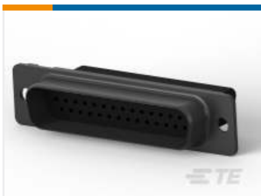
TE Part # 1658672-1 HDP-22,PLUG,SIZE 3,44 POSN