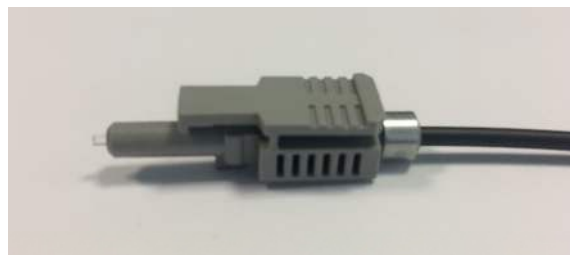
FIGURE 4. Cable and Connector Positioning

Insert the stripped POF cable into the backside of the connector until the mechanical stop is reached. Approximately 1.5 mm of the POF internal core should protrude from the top of the connector.