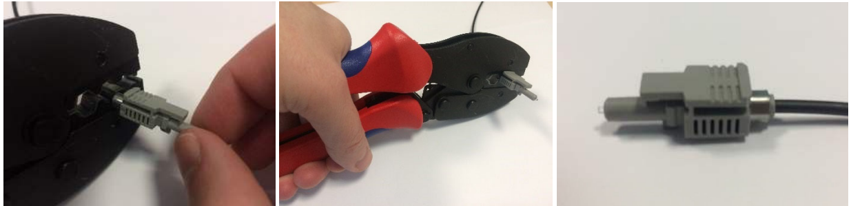
FIGURE 5. Secure Simplex Connector

Place the plug into a suitable crimp tool (e.g FF-HTCRMP-1) with hexagonal crimp of 4.85 mm across flats. Use crimp tool to fasten the cable onto the plug. Ensure the crimp ring is tight and the simplex latching plug is undamaged after crimping.