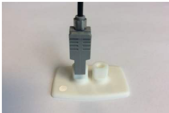
FIGURE 6. Polishing Disc

After polishing, wipe the connector with a clean tissue removing foreign particles. Using 3 \mu\text{m} grit, polish again for a smooth surface and wipe clean again. Best attenuation values are achieved applying wet polishing.