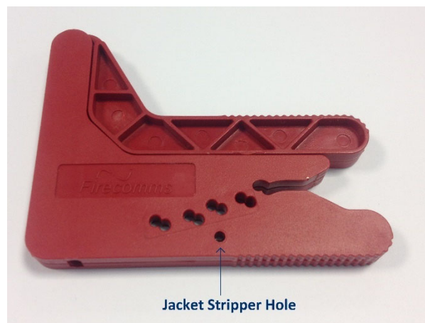
FIGURE 3. Jacket Stripper on POF cutter

In order to strip the jacket from the POF, insert the cable into the hole at the bottom of the Firecomms POF cutter (PC-220F-410). After insertion, twist the cutter 360 degrees to cut the jacket and pull out the cable to reveal the exposed POF core.