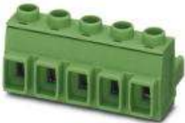
The illustration shows the 5-position version of the product

Plug component, Nominal current: 16 A, Rated voltage (III/2): 1000 V, Number of positions: 3, Pitch: 7.62 mm, Connection method: Screw connection, Color: green, Contact surface: Tin