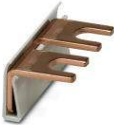
Wiring bridge for modules with connecting pitch 17.5 mm, 1-phase, 2-pos.

Please be informed that the data shown in this PDF Document is generated from our Online Catalog. Please find the complete data in the user's documentation. Our General Terms of Use for Downloads are valid ( http://download.phoenixcontact.com )