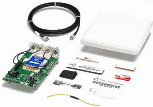
M6e Reader DevKit shown