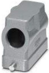
HEAVYCON B16 sleeve housing, for single locking latch, height: 76 mm, with 1 x M32 thread, lateral cable outlet

Please be informed that the data shown in this PDF Document is generated from our Online Catalog. Please find the complete data in the user's documentation. Our General Terms of Use for Downloads are valid ( http://phoenixcontact.com/download )