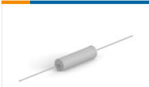
TE Part #4-2176414-8 7W STD M/OX 5% 1K8