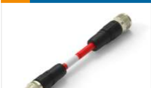
TE Part #TAA545B1411-060 M12A4-MS-FS-PVC-6.0M