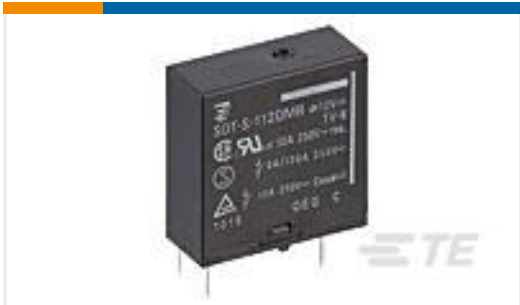
TE Part #8-1419125-5 SDT-S-106LMR,000