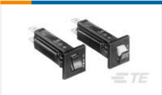
TE Part #1-1393250-7 W28-XQAT-15=W28