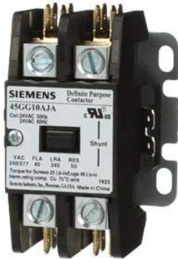
Contactor, 45DP,40A,1P,Open,277 Contactor, 45DP,40A,1P,Open,277