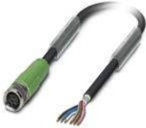
Sensor/Actuator cable, 6-position, PUR halogen-free, Black-gray RAL 7021, shielded, Free cable end, on Socket straight M8, Cable length: 5 m

Please be informed that the data shown in this PDF Document is generated from our Online Catalog. Please find the complete data in the user's documentation. Our General Terms of Use for Downloads are valid ( http://download.phoenixcontact.com )