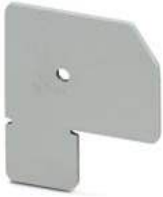
Separating plate, Width: 2 mm, Number of positions: 0, Color: gray

Please be informed that the data shown in this PDF Document is generated from our Online Catalog. Please find the complete data in the user's documentation. Our General Terms of Use for Downloads are valid ( http://download.phoenixcontact.com )