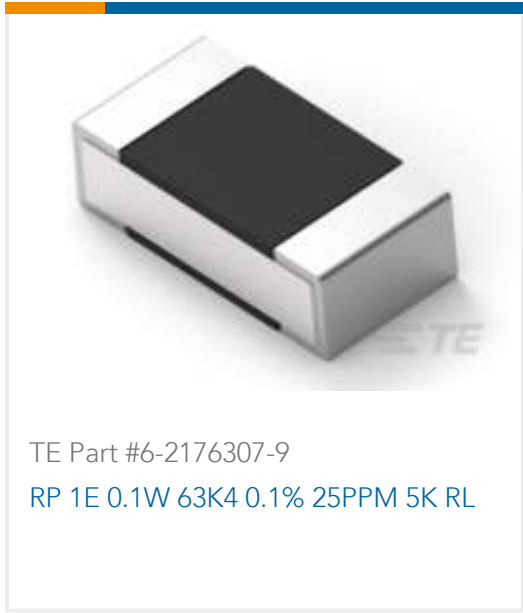
TE Part #6-2176307-9 RP 1E 0.1W 63K4 0.1% 25PPM 5K RL