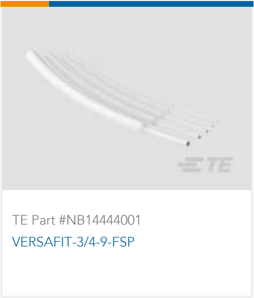
TE Part #NB14444001 VERSAFIT-3/4-9-FSP