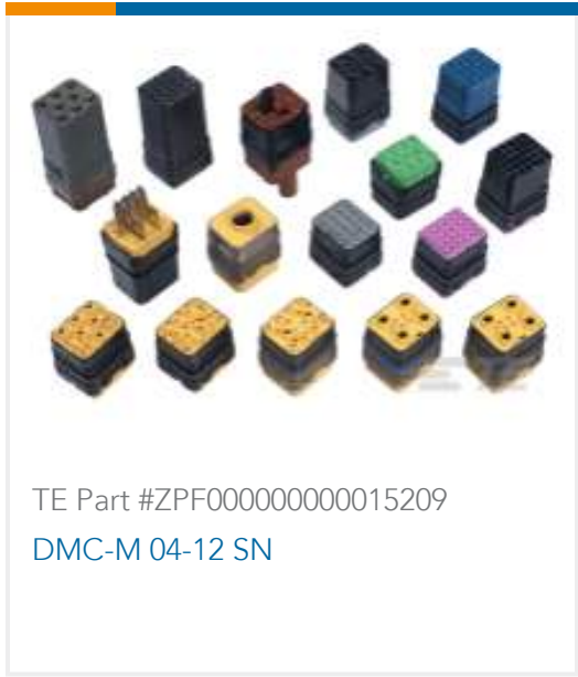
TE Part #ZPF000000000015209 DMC-M 04-12 SN