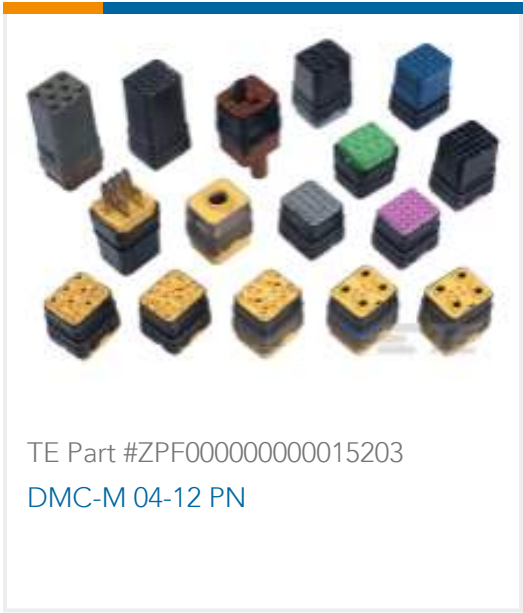
TE Part #ZPF000000000015203 DMC-M 04-12 PN