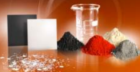
NTC THERMISTOR CERAMICS

Tewa products will be Restriction of Hazardous Substances Directive (RoHS). We are enhancing our process to offer you, our customer, products meeting the relevant quality and environmental standards.