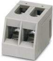
Transformer terminal block, Connection method: Screw connection, Length: 28.5 mm, Width: 20 mm, Height: 19 mm, Color: gray

Please be informed that the data shown in this PDF Document is generated from our Online Catalog. Please find the complete data in the user's documentation. Our General Terms of Use for Downloads are valid ( http://phoenixcontact.com/download )