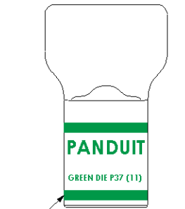
Color coded barrel markings