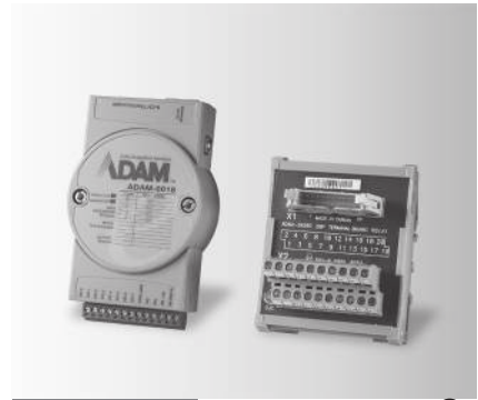
ADAM-6018 FCC CE RoHS UL LISTED E129381 E.T.C.