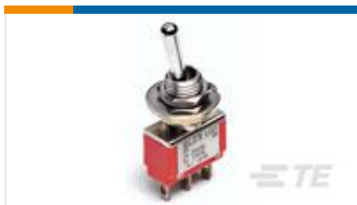
TE Part #4-1825136-5 A101SYCQ04