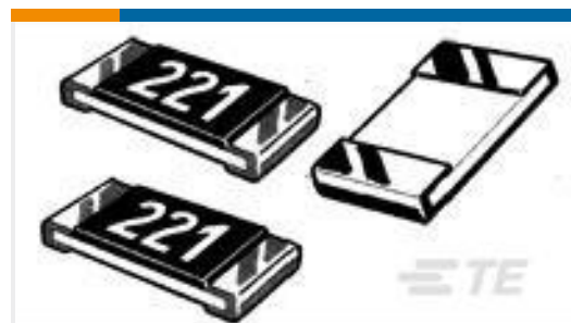
TE Part #5-1622820-0 3520 47R 5%