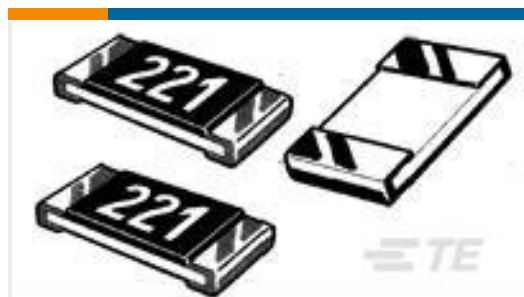
TE Part #2176070-1 3521 10R 1% 2W