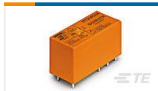
TE Part #1419108-1 RT114012