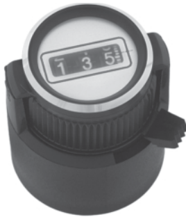
23-1-21 Projecting L. 31.5 mm